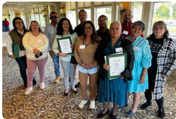
Members of RVCC's Facilities, Housekeeping and Grounds staff were among those celebrated on October 17

Some 52 employees were recognized for their full-time years of service and dedication to the College at the 19th Annual Service Awards Program, held on October 17. The awards program, the “Dandy Lion Service Award,” recognizes those with five-year increments of service. The event was held at Raritan Valley Country Club and was generously sponsored by Affinity Federal Credit Union .