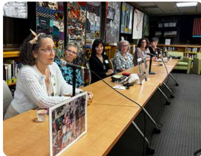
Artists lead the discussion of their work.