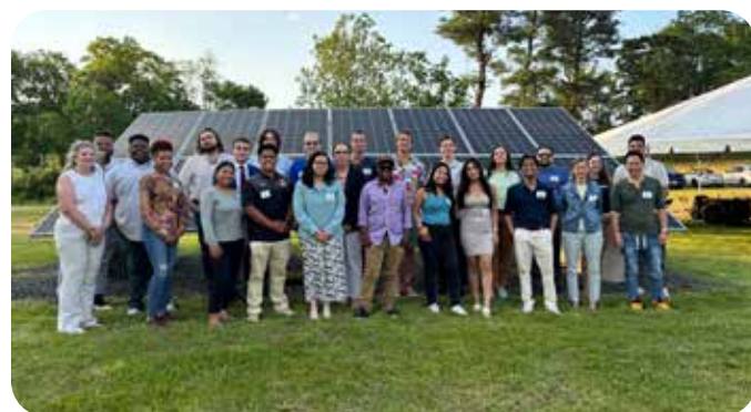
Alumni stars were out at the 2nd Annual RVCC Alumni Association Summer Celebration at 74 Lamington Road

Members of the RVCC Alumni Association gathered on campus at the RVCC Planetarium October 24 to learn more about the "Stars are Rising" fundraising campaign and experience a special Halloween-themed program featuring the theater's new digital projection system. The "Stars are Rising" initiative seeks to raise $600,000 by June 30 to assist with upgrades of the lobby, exhibit space, and main entrance.