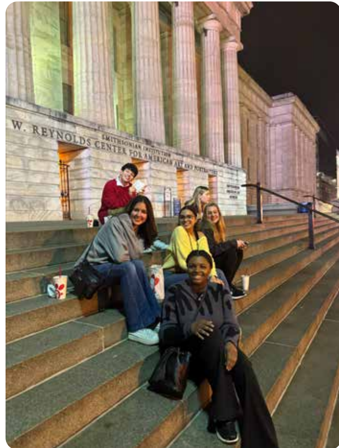
RVCC Honors College students in Washington, DC.