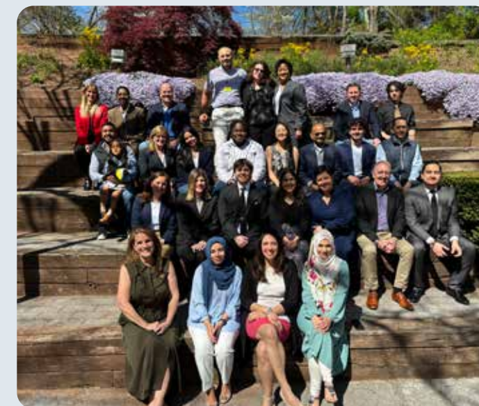
Sanofi mentors and mentees gather for last April's Closing Ceremony for Sanofi Corporate Mentor Program on the RVCC campus.