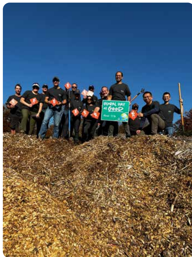
Some of the Insmed team who gave their time and sweat equity to the RV Trail at Raritan Valley Community College.

Last month, close to 200 employees from Insmed Incorporated spent their annual Global Day of Good at RVCC. The Insmed team packed meals and snack bags to benefit the RVCC Resource Center & Food Pantry, Feeding Hands, and Empower Somerset . Some of the other activities included painting murals for hospitals, sorting books, creating STEM kits, and helping out with the new campus trail that is in development. We’re proud to have been one of the many organizations Insmed supported for this meaningful day, during which over 1,000 employees gave back to local organizations across the globe.