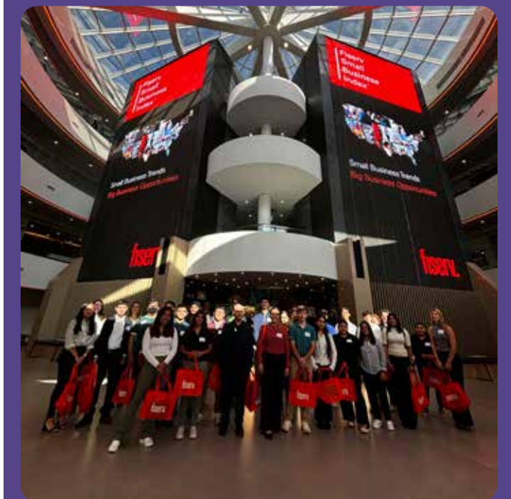
RVCC STRONG: RVCC students meet in the lobby of Fiserv to begin the immersion into the rapidly growing field of financial data services.