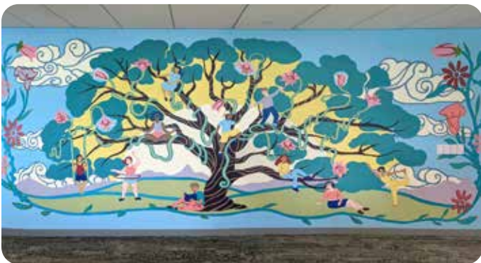
ABOVE: Brighter Lives, Better World: Mural on the wall at Signify, created by RVCC Arts & Design students

#bestofnewjersey #signify #rvccproud #raritanvalleycommunitycollege #rvccfacultyrock #rvccarts&design #rvccstudents