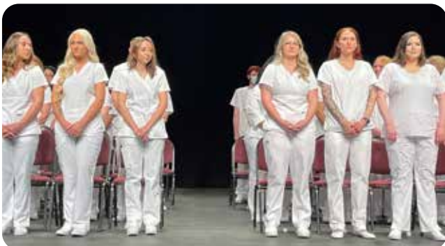
RVCC Nursing students are among the hardest working on campus and now, they're also being richly rewarded.