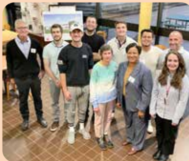
Left: Members of the RVCC Women's Volleyball Team Right: Some RVCCProud alumni!!